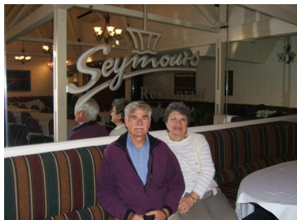
One of our favorite restaurants