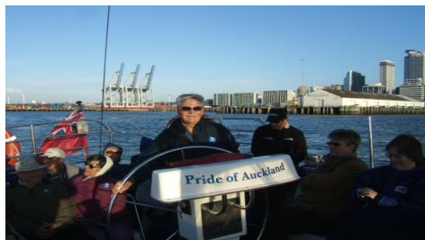
Sailing some of my friends around Auckland